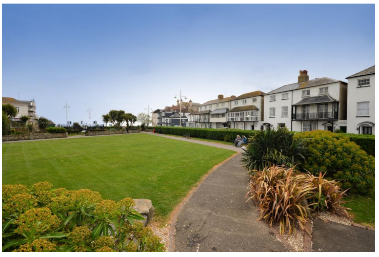
Service you deserve. People you trust.