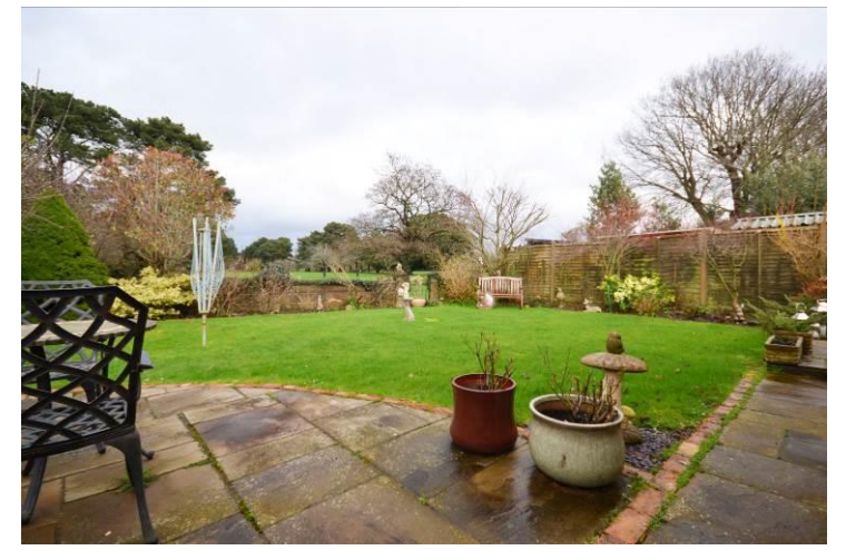
Book a Viewing

01243 861344 sales@clarkesestates.co.uk 27 Sudley Road, Bognor Regis, PO21 1EW www.clarkesestates.co.uk