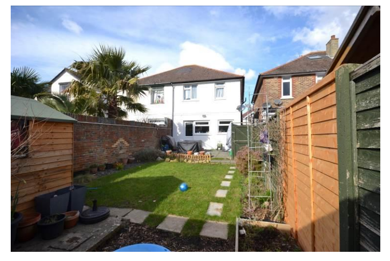
Book a Viewing

01243 861344 Sales@ClarkesEstates.co.uk 27 Sudley Road, Bognor Regis, PO21 1EW http://www.clarkesestates.co.uk