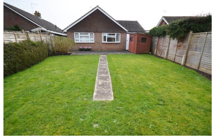
Book a Viewing

01243 861344 Sales@ClarkesEstates.co.uk 27 Sudley Road, Bognor Regis, PO21 1EW http://www.clarkesestates.co.uk